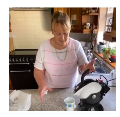
General End User