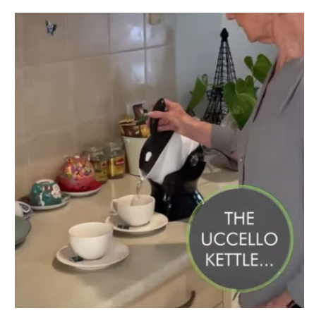
Elderly End User